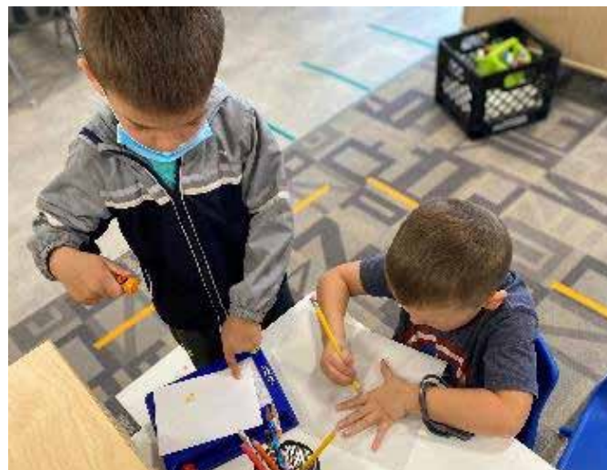
Wyatt and Cohle are exploring stamps in the writing center.