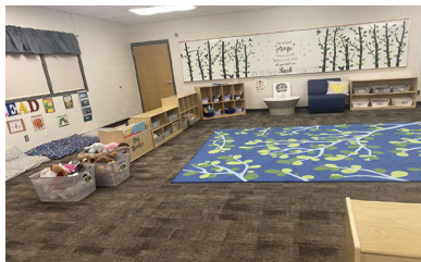
Our center library is a place where children can enjoy books and check out a book to take home and share with their families.